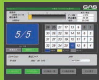
③ After inputting the goods, press the foot switch.