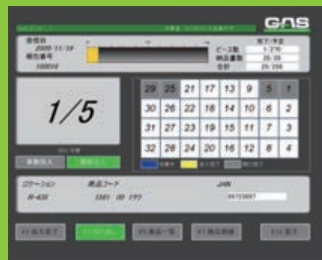
② If repeat the product scan, the gate will open until denominator is up to the quantity.