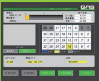
① Product scan